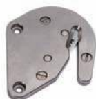
Knife with stainless support