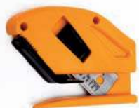
Knife with plastic support